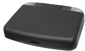
8" ROOFMOUNT TFT-LCD MONITOR YOU'RE NOW READY FOR MORE FUN ON THE ROAD THAN EVER BEFORE